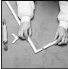
2. Snap frame together and install screen