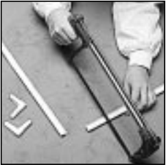
1. Cut frame to length